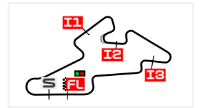
Automotodrom Brno 5403 m.