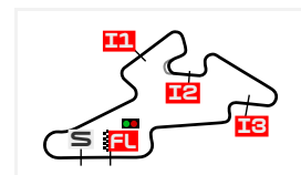
Automotodrom Brno 5403 m.