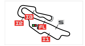
Autodromo Internazionale del Mugello 5245 m.

IT Ideal Lap Time, sum of the best partial times