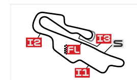
Autodromo Internazionale del 5245 m. Mugello

IT Ideal Lap Time, sum of the best partial times