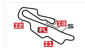
Autodromo Internazionale del 5245 m. Mugello

* Lap / Sector time cancelled P Crossing the finish line in pit lane