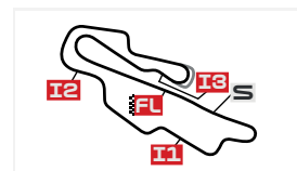
Autodromo Internazionale del Mugello 5245 m.