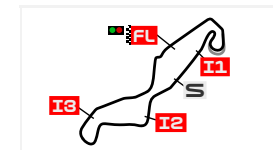
TT Circuit Assen