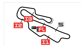
Autodromo Internazionale del Mugello 5245 m.