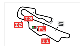
Autodromo Internazionale del Mugello 5245 m.