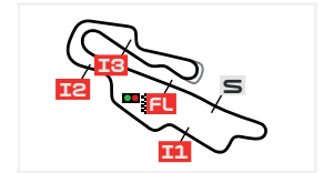
Autodromo Internazionale del 5245 m. Mugello

IT Ideal Lap Time, sum of the best partial times