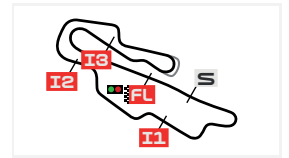
Autodromo Internazionale del 5245 m. Mugello