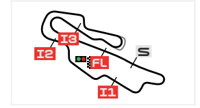
Autodromo Internazionale del Mugello 5245 m.

IT Ideal Lap Time, sum of the best partial times